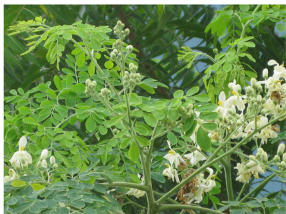
Figure 1 Moringa oleifera tree leaf.

In order to test the efficacy of Moringa oleifera leaf powder, we used an adapted protocol of the European Committee for Standardization (EN 1499) [14] which is designed to evaluate the ability of hand-wash agents to eliminate transient pathogens from volunteers' hands without regard to resident micro-organisms. This procedure is based on the